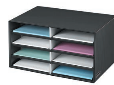
DECORATIVE Literature Sorter - Letter 6170301 Pinstripe