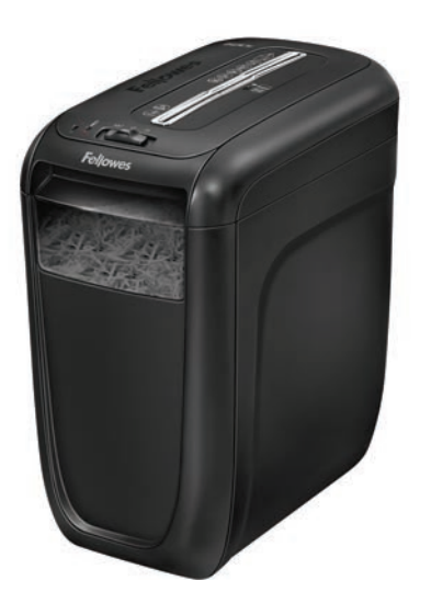
POWERSHRED® 60Cs Cross-Cut Shredder 4606004