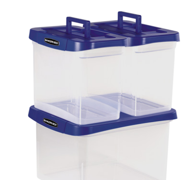
HEAVY DUTY Plastic Box 0086302 - Portable Box 0086207 - Letter/Legal File Box