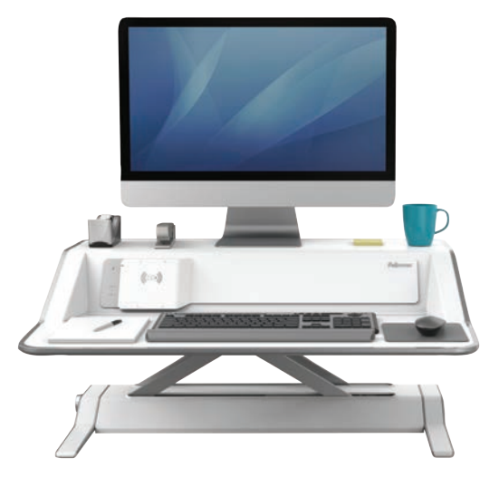
LOTUS<sup>™</sup> DX Sit-Stand Workstation

Begin by standing for 15 minutes, followed by 45 minutes of sitting. Gradually increase the time standing. Alternate between sitting and standing throughout the day, but don't sit or stand for more than 60 minutes at a time.