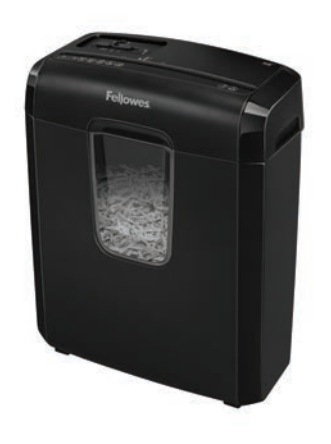
POWERSHRED® 6C Cross-Cut Shredder 4771502

The risks of identity theft remain even when you work remotely. If you're managing confidential documents from your home office, be sure to follow your company's document destruction policy. Cross cut and micro cut paper shredders provide the highest levels of security. Find one that fits your home office.