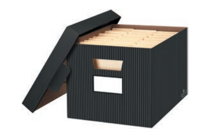
DECORATIVE Stor/File™ 0029803 Pinstripe