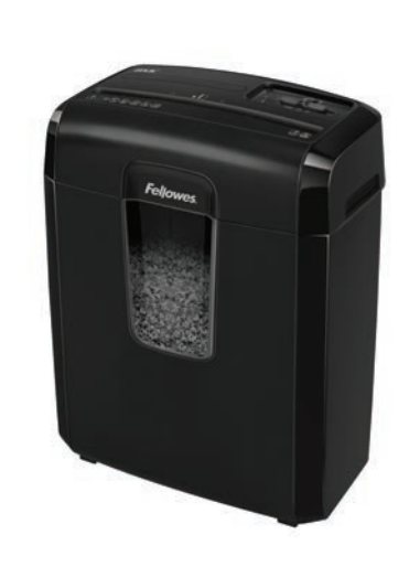
MICROSHRED 8MC Micro-Cut Shredder 4692402